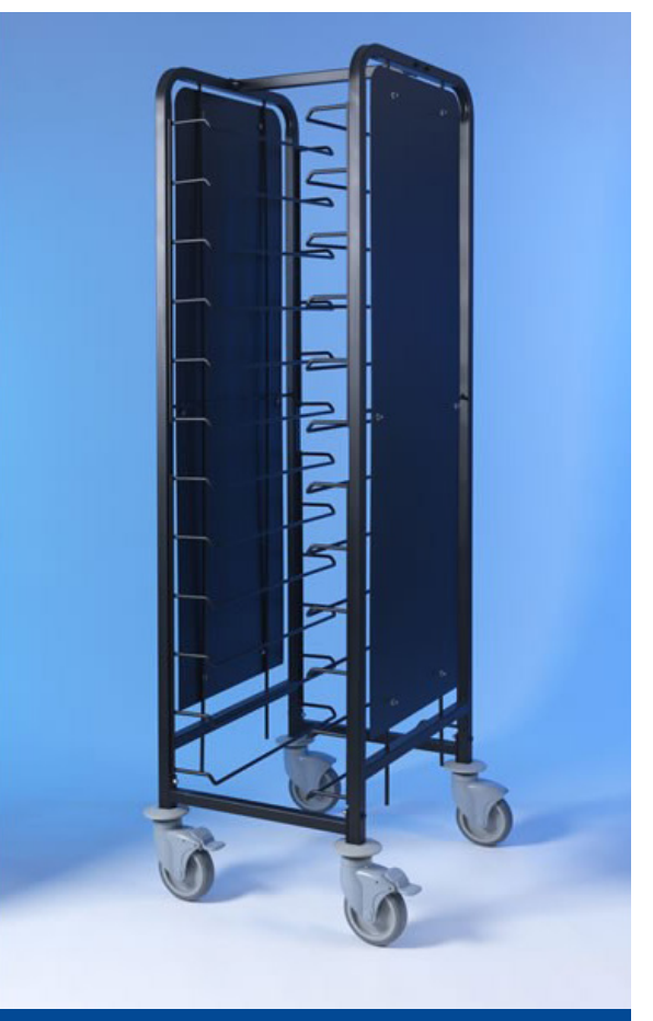
shows unit fitted with optional black side panels