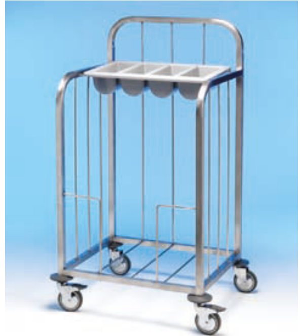
shows single tray model